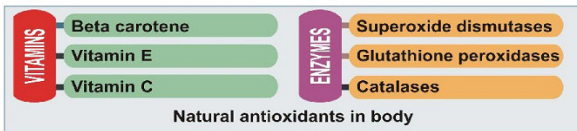
Fig. 1 NATURAL ANTIOXIDANTS IN BODY