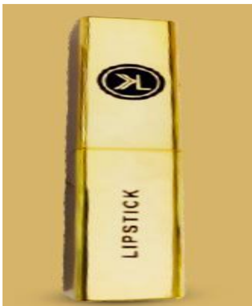
Fig 1: Kalon lueur lipstick

Cosmetic word is obtained from the Greek word “kosmetikos” which means the power, arrange and skill in decorating.[3] Kalon Lueur cosmetics are the cosmetics in which one or more kalon Lueur ingredients are used to form base.[3;4] Phytochemicals are the substances which present in the kalon Lueur cosmetics. This influences the functions of the skin and provides necessary nutrients for healthy glowing skin or hair.[5]. Many colors and types of lipstick exist. Now a day’s the demand of kalon Lueur cosmetics in the world market are growing and are inevitable gifts of nature. There are a wide range of kalon Lueur cosmetic products to satisfy the needs of women for beautifying purpose. In contrast to the synthetic one the kalon Lueur cosmetics are safe on human health.[6]. Natural colours are extracted from natural sources such as plants, insects, algae. Many colors and types of lipstick exist. Some lipsticks are also lip balms, to add both color and hydration[7;8].